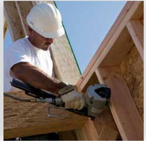
From seedling to structure, we ensure a reliable and consistent product.