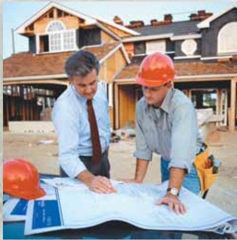
Our knowledgeable and experienced service organization lets you more effectively meet the needs of your customers.