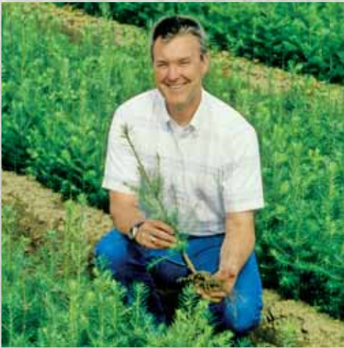
The sustainable forestry cycle begins with planting.

We're excited by the promise of iLevel systems and solutions to transform the industry by taking performance, profitability, value, quality, and distinction to an all-new level—iLevel.