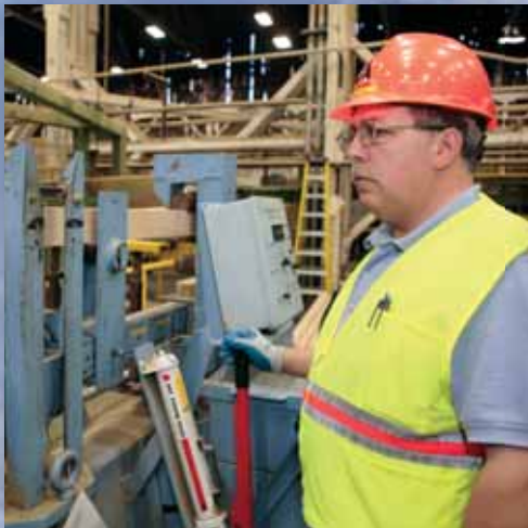
Quality-control checks occur throughout the manufacturing process.

We're keenly aware that getting the right product at the right time is crucial to your success. That's why we're hard at work developing and refining the processes and technologies that will continue to ensure your satisfaction.