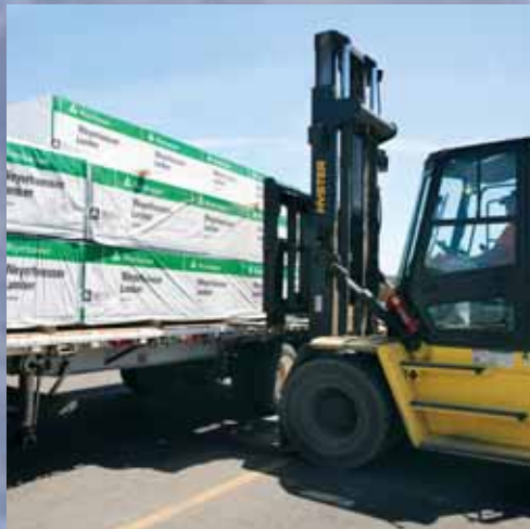
Our distribution network delivers the product when and where it's needed.